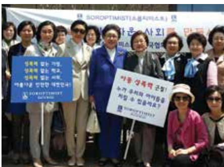
Korea Region members raised awareness about sexual assault in their local community.

Korea Region clubs SI/Seoul, SI/Hanyang, SI/Namsan, SI/Chungdam, SI/Seocho, SI/Seoseoul, SI/Hannam and SI/Newkangnam, recently gathered to raise awareness about sexual assault. Club members distributed more than 2,000 whistles and carried signs in Seoul. The whistles, which included the Soroptimist logo, are for women and girls if they find themselves in a threatening situation. Kudos to the clubs for their dedicated work on this important issue.