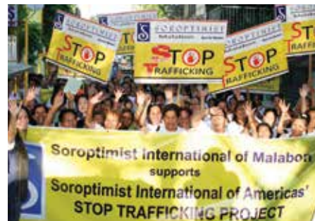
SI/Malabon members held a Campaign to Stop Trafficking walk.